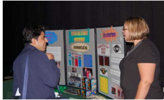
A graduate student visiting the information booths following graduate student orientation